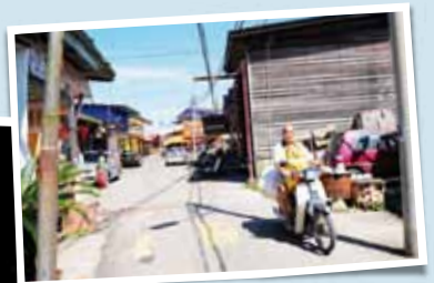
• Kuala Selangor Village