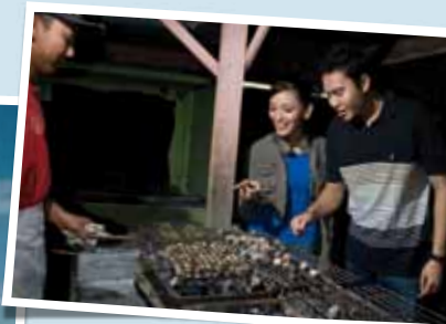
• Grilled Fish Pantai Remis