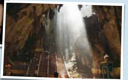
• Batu Cave