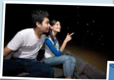
• Fireflies at Kampung Kuantan

For more details, check out the WCOA 2010's pre-and post-tours. It also offers optional half day tours such as the Kuala Lumpur countryside and Batu Caves Tour.