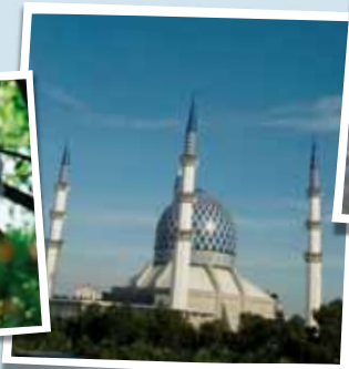
• Blue Mosque