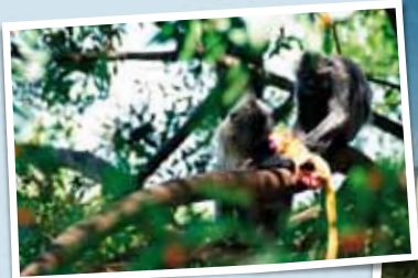
• Silver-leafed Monkeys