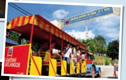
• Melawati Hill