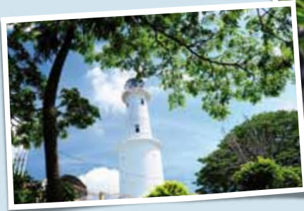
• Melawati Fort