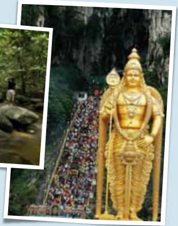
• Batu Caves