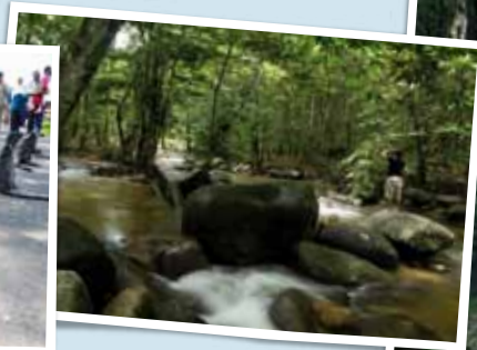
• Sg. Tua Waterfall