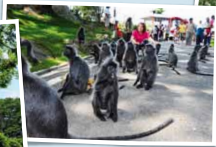
• Melawati Hill